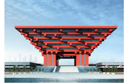
World Expo Shanghai 2010

As one of the leading events dedicated to recruitment market in China, it will continue to provide a cost-effective platform to meet face-to-face with your targeted visitors. It is also set to present overseas schools a great opportunity to showcase the quality programs, courses and curriculum by touring Beijing, Dalian, Xi'an, Shanghai, Chengdu and Kunming, the most important recruitment markets across the country.